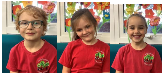
Otters Class Reps

Firstly, can I just say a huge thank you and well done to all the Year 2 children who completed posters and stood for the various roles on the Student Council this year. You are all amazing and I know the voting process was very close between everyone.