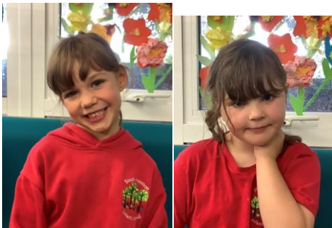
Red Squirrels Class Reps